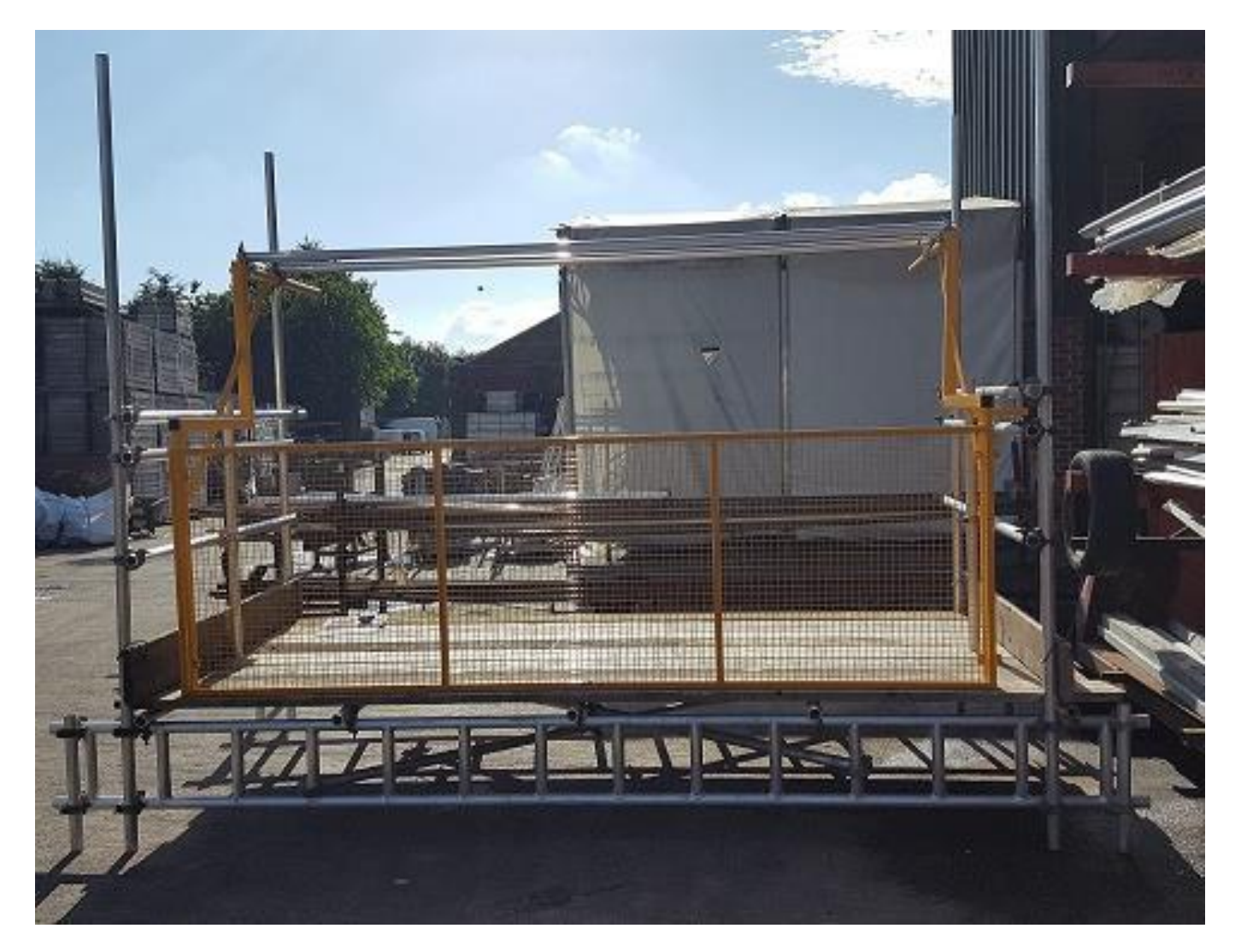
Fixed Gate - Drawing Number: SS0041 & SS0040