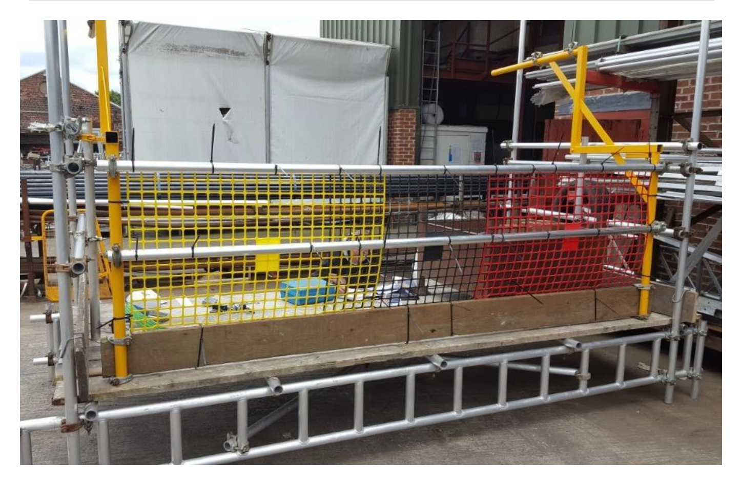
Tube & Fitting Gate - Drawing Number: SS0041 & SS0043